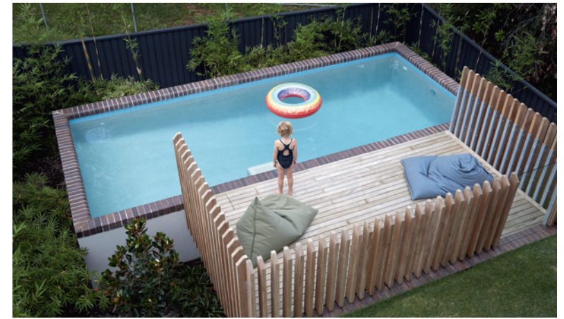
UPLIFTING ASPECT ... A plinth incorporates the raised lawn and above-ground pool.

Architect: Arcke ph: 3180 0287 Builder: P & R Lee Builders, ph: 0411 692 711