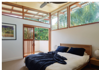
ROOM TO GROW ... Green views abound in a house designed for all seasons.

physical dimensions of the interior. To optimise spatial efficiency, the living room and deck work in tandem to accommodate the daily demands of living and dining.