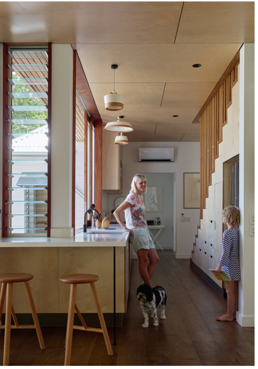
BREEZE IN ... The galley kitchen is the hub of the home, bridging the old and new.